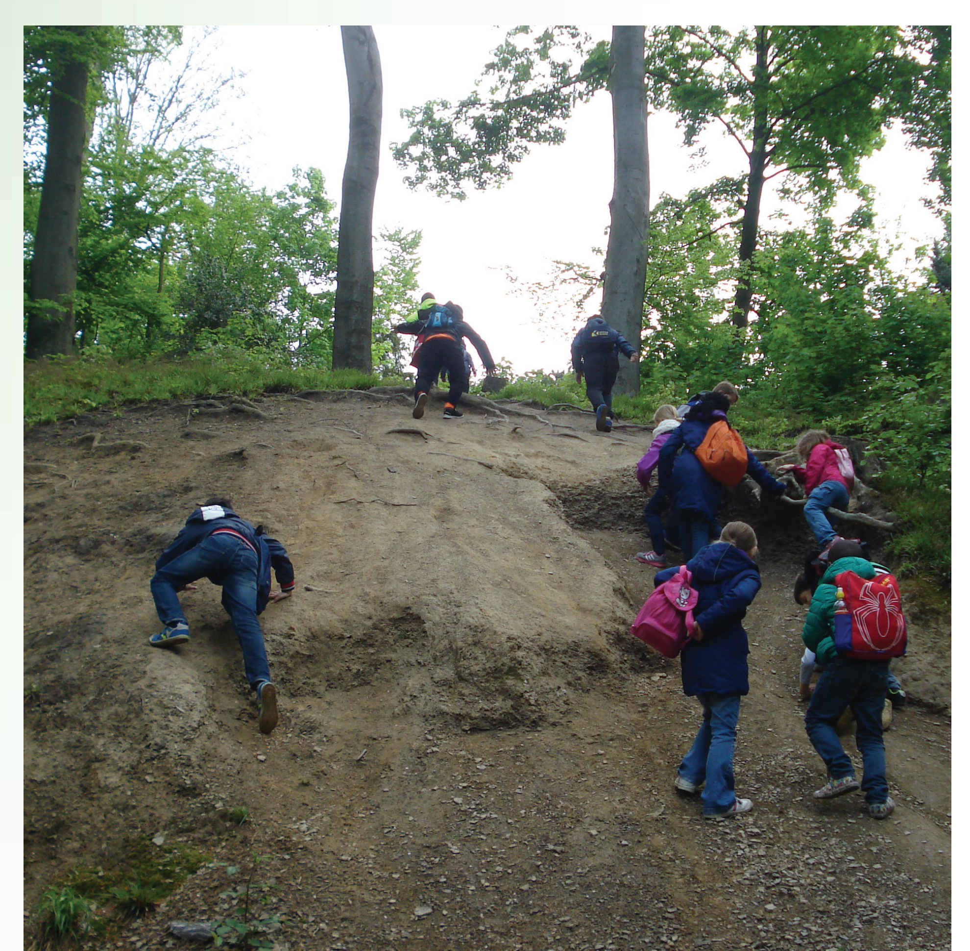
Fig. 1: Soil science classroom

Extracurricular environmental education favours natural science skills, motor skills, language development, creativity and social skills in the group. So it is possible to adapt to future challenges. Exploratory learning in cooperative learning units in an extracurricular learning environment (industrial brownfields, industrial forests and urban forests) educates on social, communicative, inclusive and integrative levels. Own ideas and experiences are brought in by the children and the BSWR staff only act as moderators and supporters. Seven inclusive and integrative projects in urban forests with the aforementioned environmental pedagogical approaches are presented. They cover widely knows sites as Landscape Park Duisburg Nord as well as small industrial brownfields, semi-forested areas within settlements or forest parks and larger forest areas in the Ruhr metropolitan area. Schoolchilrden of all ages and all types of school are addressed.