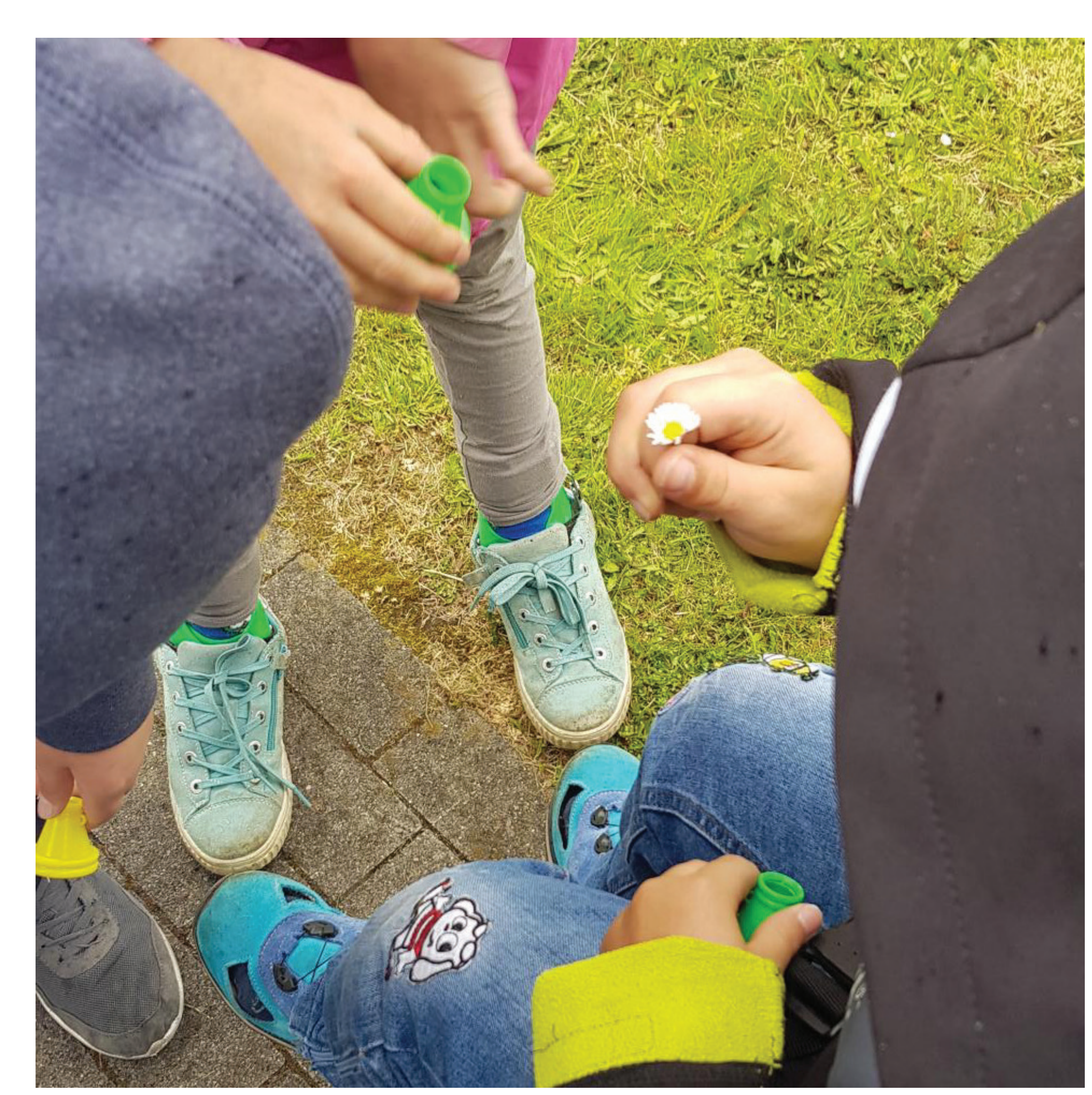
Fig. 2: Env. education for disabled children