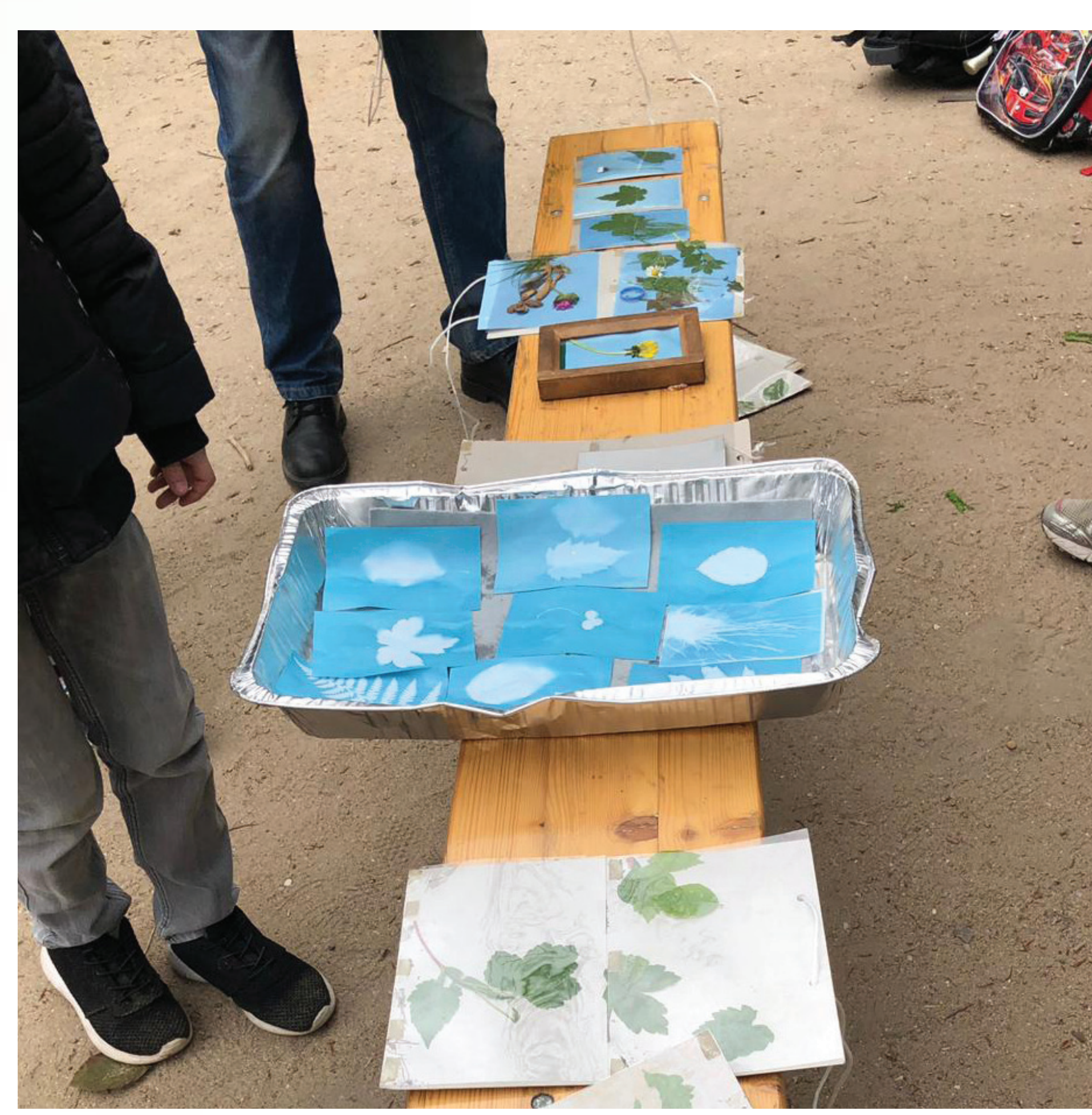
Fig. 3: Nature meets art