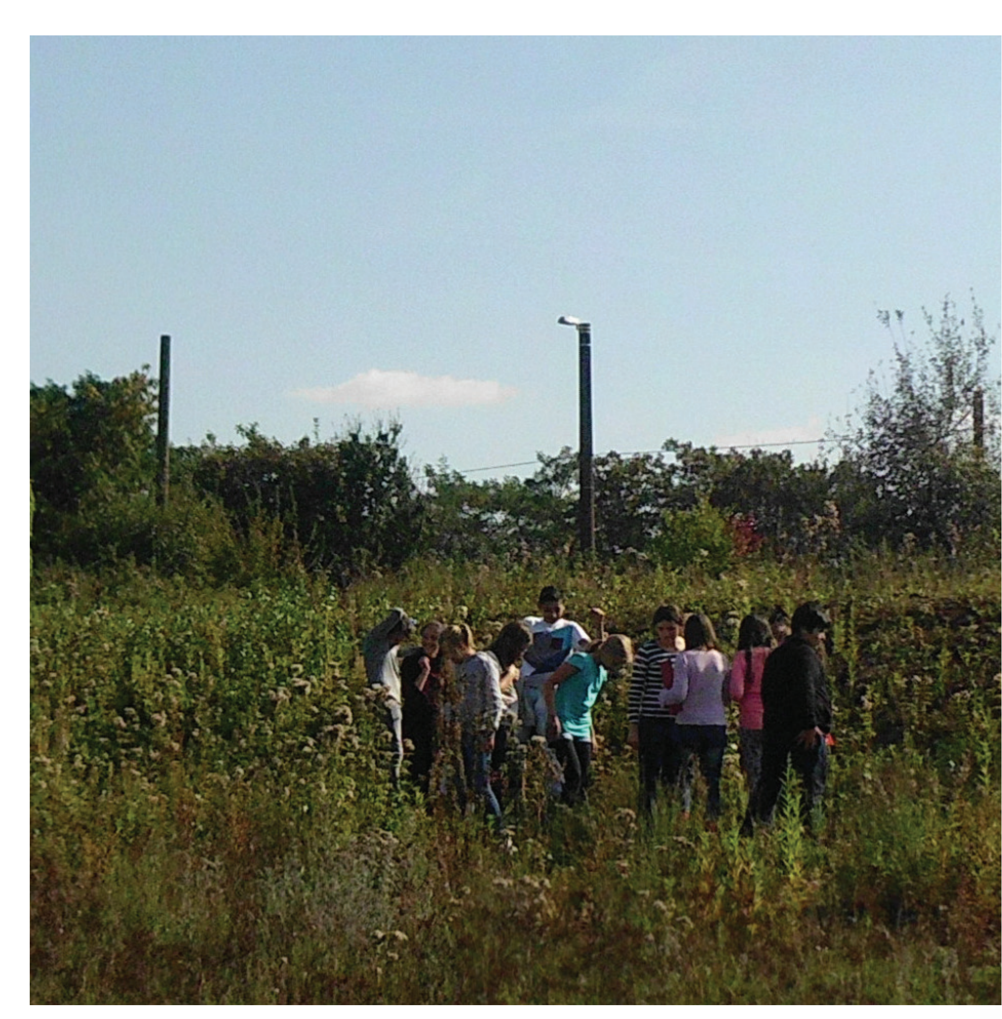
Fig. 4: Environmental education